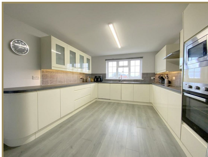
Rose Cottage, Wembley Road, North Somercotes, LN11 7NP £315,000